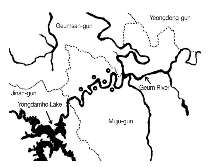
Fig. 1. Location of surveyed areas in Bunam-myeon, Muju-gun, Jeollabuk-do, Korea. Dot (♠); survey areas in Muju-gun along the Geum River basin.

Stool specimens were collected in plastic containers and transferred to the laboratory of the Korea National Institutes of Health, Osong, Chungcheongbuk-do. A part (1 g) of each fe-