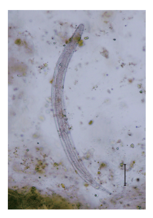
Fig. 1. A rhabditoid larva of Strongyloides stercoralis visible in the stool using formalin-ether concentration method. \times 400. Bar = 50 \mu m.

moderate ascites involving the jejunum, ileum, and ascending colon. She was treated with ceftriazone and trizel for a clinical suspicion of enterocolitis. Stool examination was performed to evaluate the eosinophilia that remained uncontrolled despite the steroid therapy. The formalin-ether concentration method revealed S. stercoralis rhabditoid larvae of 320 to 325 µm in length and 15 to 18 µm in width (Fig. 1). Colonoscopy showed multiple aphthous ulcerative lesions throughout the colon, indicating chronic colitis. Eosinophilic colitis without evidence of S. stercoralis larvae was noted in a colonic biopsy. Fecal specimens were cultured using the Baermann's funnel method; however, filariform larvae were not observed until after 72 hr in culture. Therefore, we identified S. stercoralis in stool samples by PCR using specific primers as previously described [19]. The patient was treated with 400 mg of albendazole twice a day for 14 days and her abdominal pain and diarrhea improved. S. stercoralis larvae were no longer detected in stool examination and PCR in the follow-up examinations (Fig. 2), and the eosinophilia was improved.