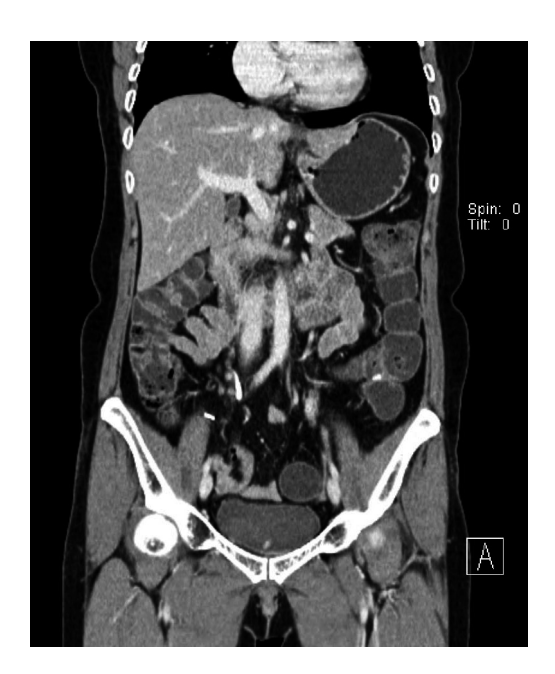
Fig. 4. No abnormal lesion was observed after 1-year follow-up.

Pathological examinations were performed for the resected colon. Histologically, numerous eggs of F. hepatica were noted with acute and chronic granulomatous inflammations in the subserosa and pericolic adipose tissues of the sigmoid colon and descending colon. Necrotic cysts and abscess formations were observed around the granulomas. Eosinophils showed diffuse infiltrations in the subserosa, and scattered eosinophils