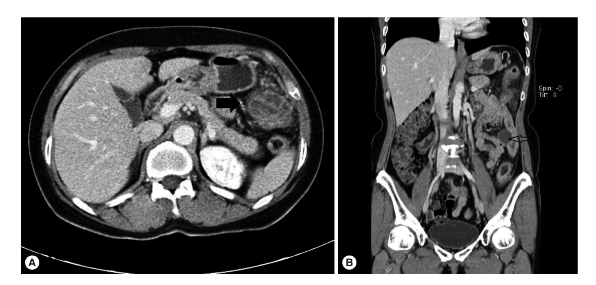
Fig. 1. (A) Abdominal CT showing 2 abscesses in the anterior aspect of the distal transverse colon (4 cm, arrow) in the interbowel space of the left middle abdomen (3.5 cm). (B) The coronal view of (A). The arrow indicates the abscess of the interbowel space of the left middle abdomen.