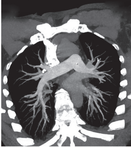
Fig. 5. CT angiogram after 6 months showing multiple pulmonary embolism recovered.