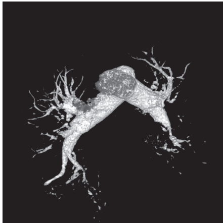
Fig. 1. CT angiogram showing multiple pulmonary embolism.