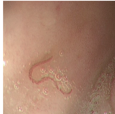
Fig. 2. Gastroscopy showing red worms swimming in the duodenum.